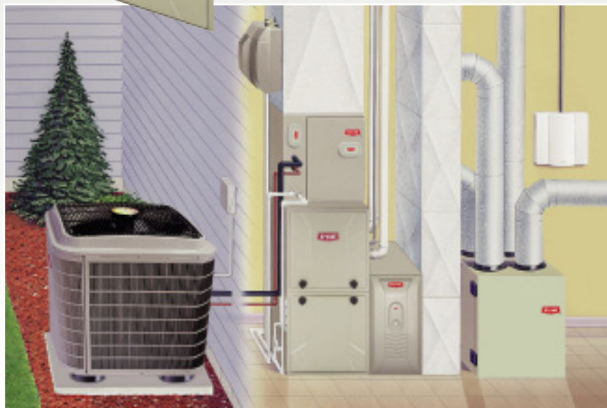
HYBRID HEAT® Deluxe Heat Pump and Deluxe Gas Furnace System